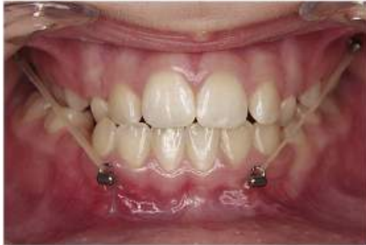
Fig 1. Position of the 4 bone anchors and intermaxillary elastics in the BAMP protocol.